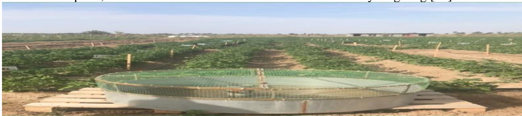
Figure (7): Evaporation basin used to determine the irrigation date in a research experiment [20]

If the irrigation process is carried out when 40 mm evaporates, equivalent to a volumetric humidity of 0.23, and the evaporation basin is used as a preliminary indicator in order to instruct taking soil samples from the field and estimating the remaining moisture in the soil actually by the gravimetric method, and the process is repeated, until 50% of the available water is exhausted for the plant, then the soil moisture is determined when actually irrigating [37].