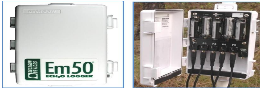
Figure (4): Em50 Data logger manufactured by the American company Decagon Devices

The sensor consists of a data storage box (EM50 Data Logger Figure 4). It contains an electronic panel connected to five electronic links through which five sensors can be connected via a 3.5 mm stereo cable. These links connect to a board containing a memory that has a high data storage capacity of 1MB and can store 360,000 readings for data entry. This panel also contains another link through which the computer communicates with the computer to output data, and this link is linked through a 3.5 mm stereo cable.