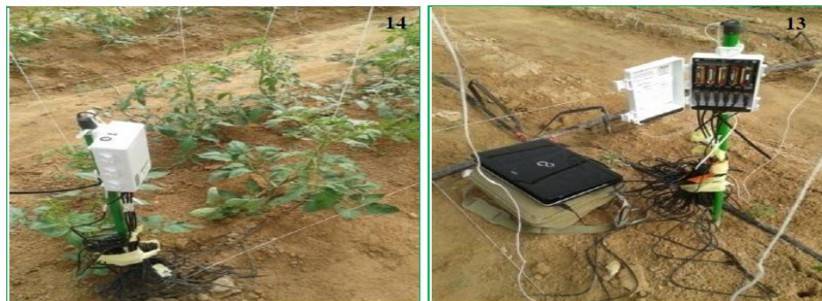
Figure (5): Installing sensors used in scheduling irrigation in one of the greenhouse fields

The device needs a very small power supply of 30 mA when the sensor is connected to the SDI-12. This box is programmed with Utility ECH2O, through which data can be stored and transferred to the computer. This supports computer programs through which data can be represented through the 3 Data Trac program to draw and represent data during the study period. As for the installation and cultivation of the sensor in the place of measurement, the sensor is placed in the soil (Figure 5) either vertically or horizontally with the mass of roots or the area to know its characteristics, such as moisture, salt or thermal content [28].