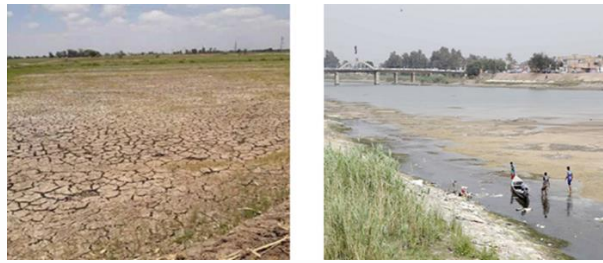
Figure (1): Low river levels for different regions of Iraq

There are many uses of water, as it is used in human, health, and industrial consumption, in addition to its uses in irrigation, which increased the demand for available water resources, including groundwater, which is the strategic reserve store of water, so the scheduling of irrigation to achieve rationalization of its use has become an urgent necessity. Since the scheduling of appropriate irrigation is the most important factor for crop growth and depends on soil systems, crops and atmosphere, it is possible to achieve moisture conditions and good oxygen content in the root zone along the growing season [7]. The addition of small amounts of water when irrigating is not enough to deliver soil moisture to the limits of field capacity, which may limit the plant's benefit from the added water. Thus, the plant will remain in continuous water stress, which leads to plant weakness and lack of productivity. The excessive use of irrigation water may increase the susceptibility of the soil and the need of the plant, and cause high ground water levels, soil salinization, and degradation, in addition to washing nutrients from the soil and deteriorating fertility. By applying the irrigation scheduling method based on the estimation of the soil moisture characteristics curve, we ensure high water use efficiency (WUE) in the management of irrigation operations, optimal investment of water resources, reduction of soil degradation, and increased soil productivity [8].