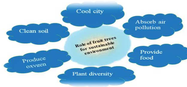
Figure 2 : Contribution of Fruit Trees to a Sustainable Environment

Based on this, the trend has moved toward the cultivation of fruit trees to ensure food security and to combat climate change. The adoption of fruit-tree cultivation varies according to farmers' individual needs and land availability. Accordingly, farm sizes vary from small areas that contain only a few fruit trees surrounding the farm to large orchards [48; 49]. The following figure shows the contribution of fruit trees to a sustainable environment. The following figure illustrates the contribution of fruit trees to a sustainable environment.